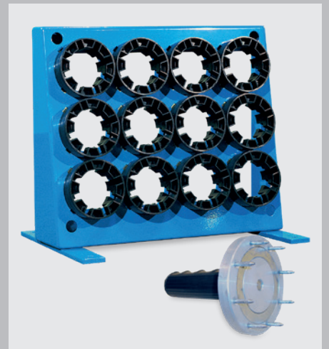
Tool base and Tool rack with QuickChange-tool as an option.