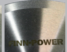
Smooth blade as an option.

FURTHER INFO ON OPTIONS, PLEASE REVERT TO SPECIFIC PRODUCT CARD