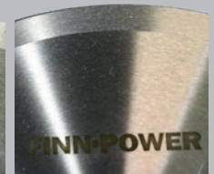
Smooth blade as an option.

FURTHER INFO ON OPTIONS, PLEASE REVERT TO SPECIFIC PRODUCT CARD